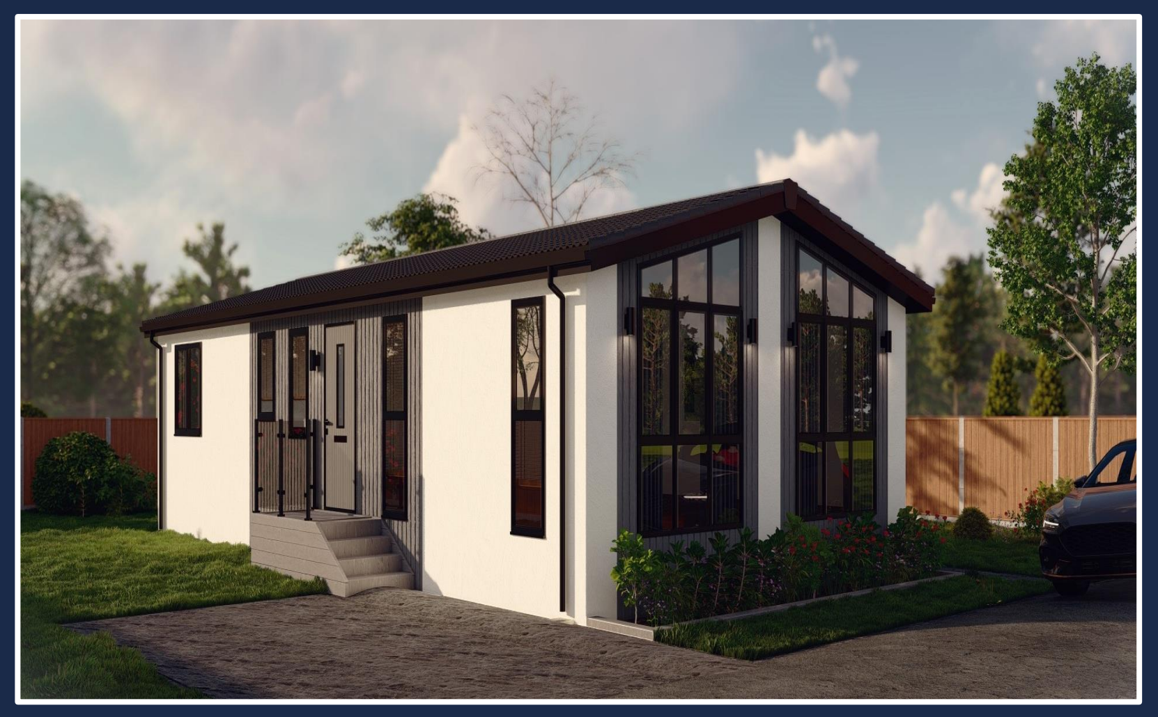
Plot 2 The Green, St Pierre Country Park, Caldicot, Monmouthshire, NP26 5TT